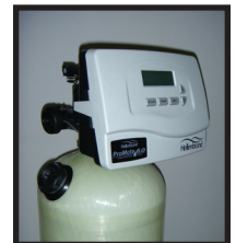
optional fill port

Acid Neutralizing Filtration System – These systems are recommended for pH adjustment for waters of pH 6.0 - 6.9. The system uses a self sacrificing media which has to be refilled periodically. Typical signs of low pH are blue green stains. Fill port option available. Does not include insulated jacket.